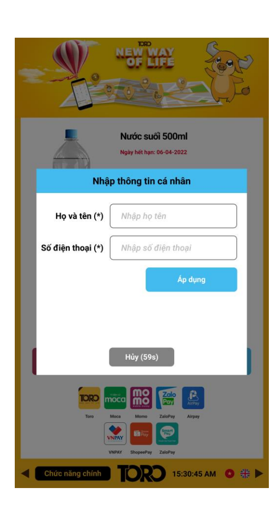
Fill in Name & Cell phone number