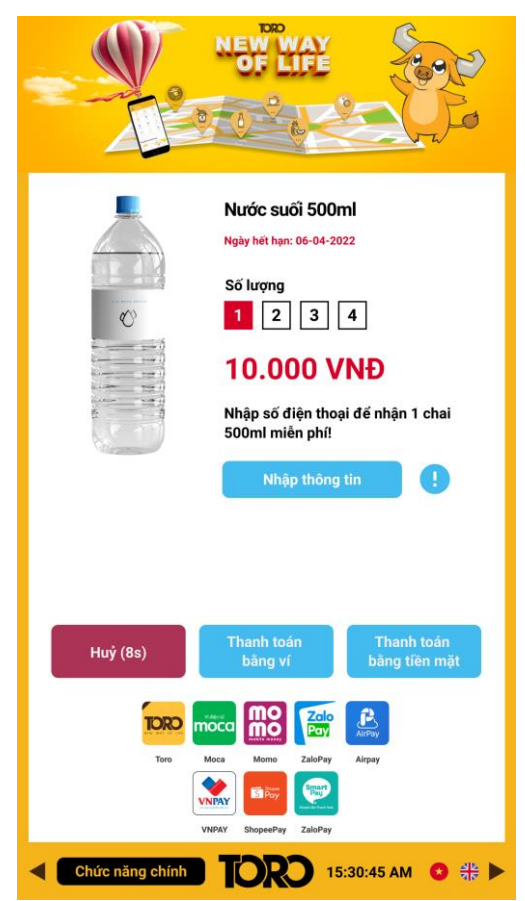
Select "Fill your info"