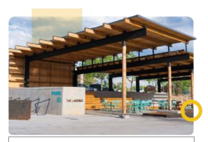
PUBLIC AREA & SHOPPING MALL BUYERS; TOURIST, FAMILY & KIDS