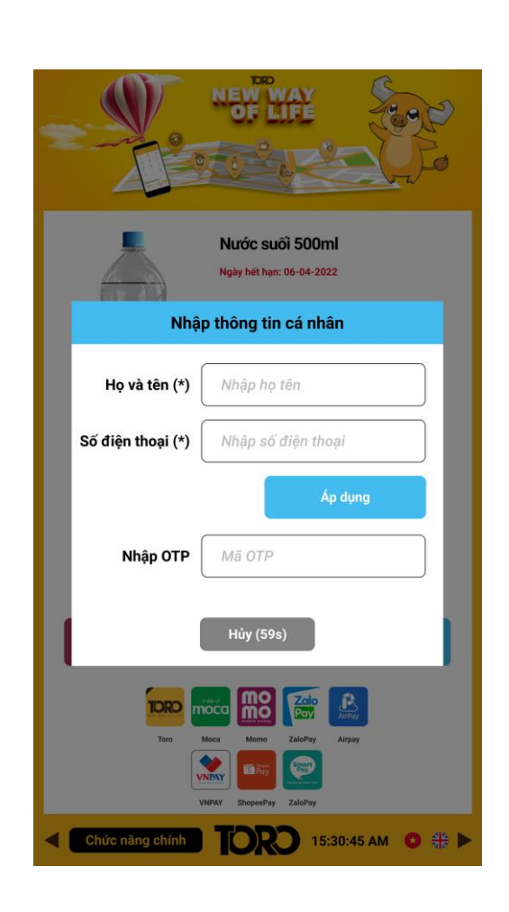
Verify by SMS OTP code